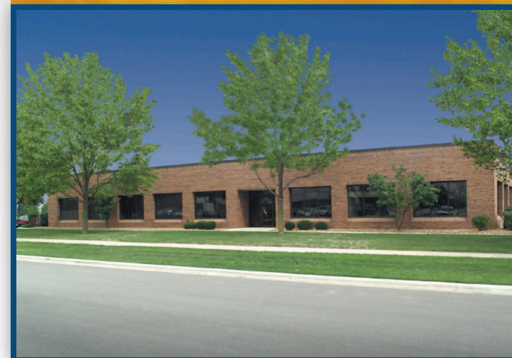
Distinctive Dental Studio, Ltd.

Chicagoland's Trusted Dental Laboratory and Custom Shade Specialist since 1984