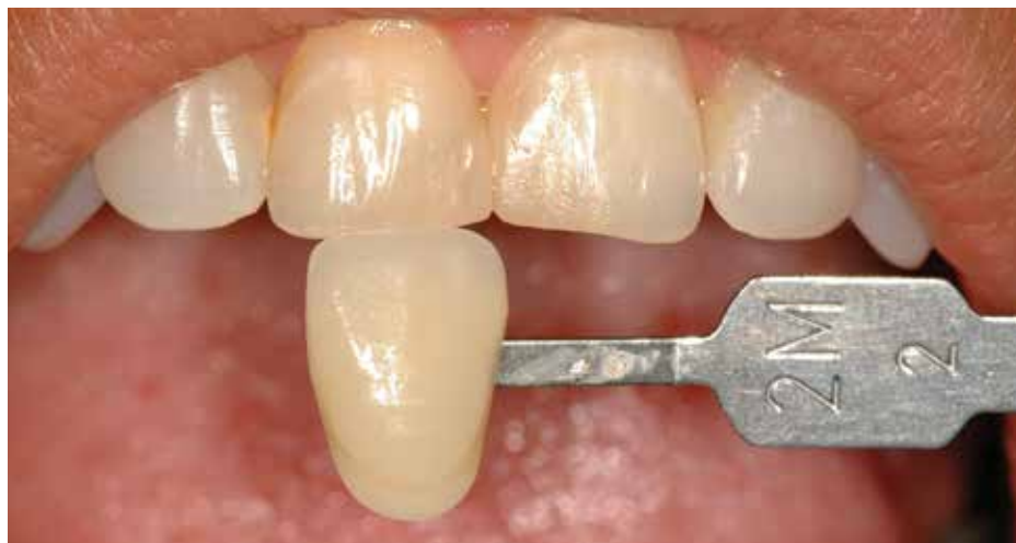
Fig. 2. Determining shade match

These factors made it easy for the patient to accept a treatment plan for crowns.