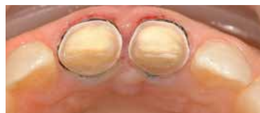
Fig. 3. Minimal preparations were required for using 3M Lava Esthetic

Once sintered, zirconia converts to a tetragonal form that is highly resistant to fracture. If a crack develops, the crystalline nature of the tetragonal material transforms to a monoclinic structure and exerts pressure on the crack to stop it from progressing. This property gives it a high flexural strength and better fracture toughness compared to other dental ceramics. However, this strength comes with compromises because the tetragonal form scatters