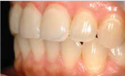
Fig. 14. Close-up left lateral view one week postoperatively

The cement can be dispensed through the syringe, placed into the crown and seated after you've cleansed the restoration and the tooth. At that point, you can cure for a one-second interval on the buccal and lingual surface (consider a light with a timer) and peel the cement away cleanly with a scaler, floss through the contacts, light-cure again for 20 seconds per surface or have the patient close for five minutes, clean up and you're done (Fig. 9). The whole process of cementing the restorations took about 30 minutes (Fig. 10).