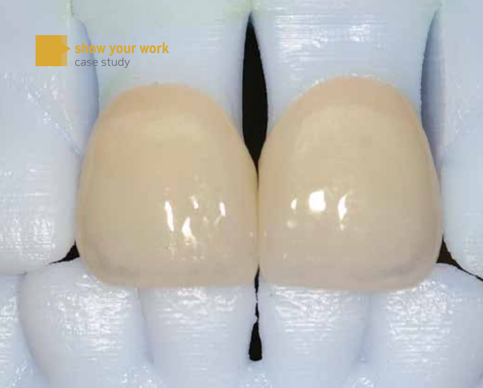
Fig. 6. Lab restorations on SLA model