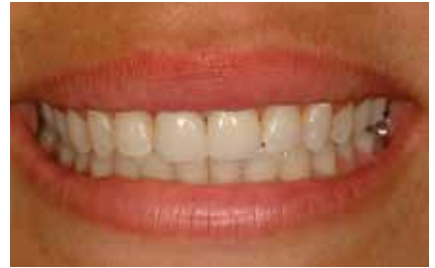
Fig. 10. Restorations immediately post-cement cleanup