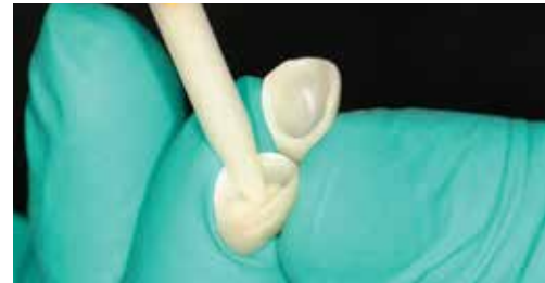
Fig. 8. Dispensing 3M RelyX Unicem 2 Self-Adhesive Resin Cement into 3M Lava Esthetic zirconia restorations

more light than natural teeth, preventing it from mimicking natural dentition.