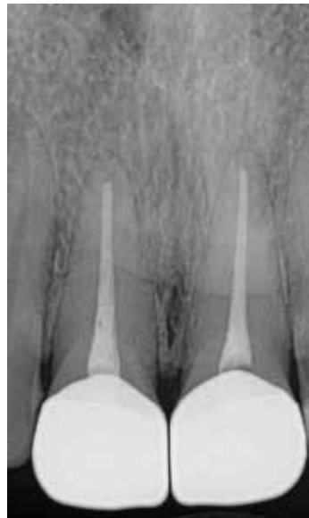
Fig. 12. Radiograph one-week postop

3M's RelyX Unicem 2 is a self-etching adhesive resin cement that requires no other formulations or chemical applications to the teeth, including etchants, disinfectants or desensitizers. For cement usage, the teeth can be cleansed with flour of pumice, dried and left in a moist condition. This will provide the optimal conditions for maximum adhesion with excellent margin sealing (Fig. 8, p. 34). It is not necessary to use a primer (MDP) when using Unicem 2 with zirconia as its proprietary chemistry yields sufficient bond strengths to zirconia in most cases.