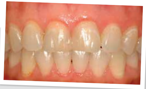
Fig. 1. A 42-year-old female patient with existing endodontics and restorative material on teeth 8 and 9.

While zirconia is a definite improvement compared to the optical properties of metals in terms of opacity, it too leaves something to be desired in terms of tooth-like light transmission, fluorescence and