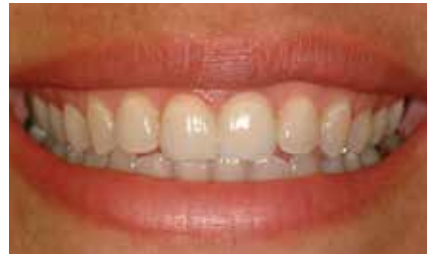
Fig. 11. Restorations one week postoperatively