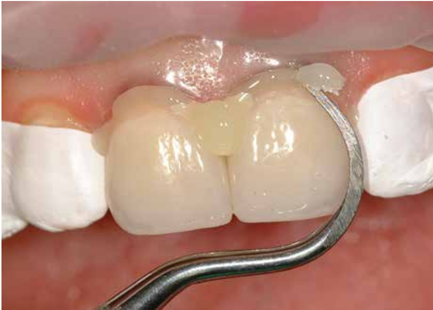
Fig. 9. Crowns seated post-one-second light cure, easy cement removal