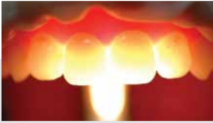
Fig. 13. Lava Esthetic zirconia allows restorations to fluoresce and look alive in UV light