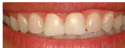
Fig. 5. Temporary material reshaped the geometries of the patient's anterior teeth