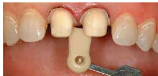
Fig. 4. Minimal preparations were required for using 3M Lava Esthetic